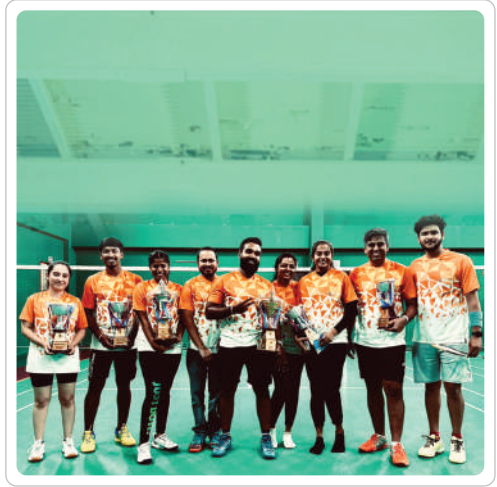
Champions - Team Westbury