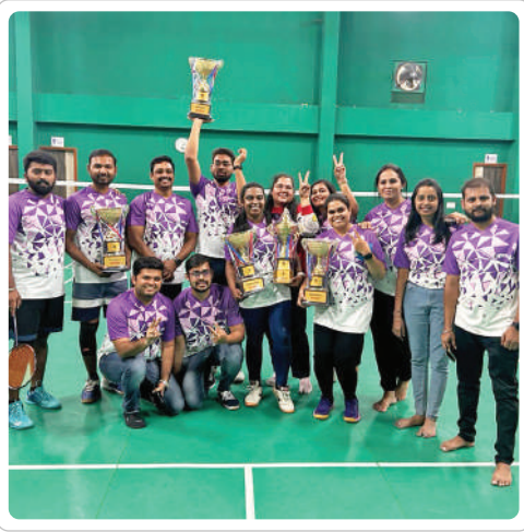
Champions - Team RK World