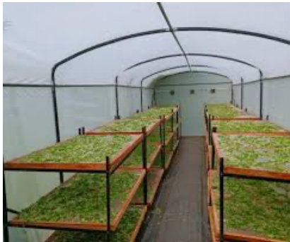
Market Smart Solutions for Agricultural Produce