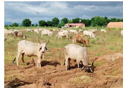
Cow Cafe: free fodder, water and shelter for animals