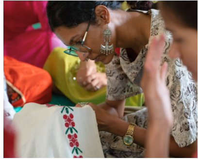
Vocational Training for Women