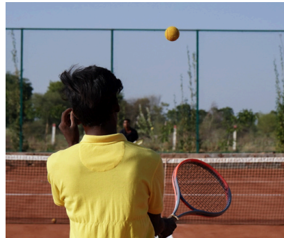
Sports Training and Scholarship Program