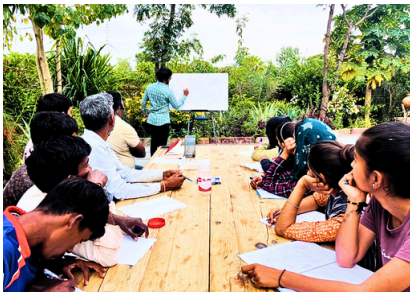
UPSC Aspirants coaching