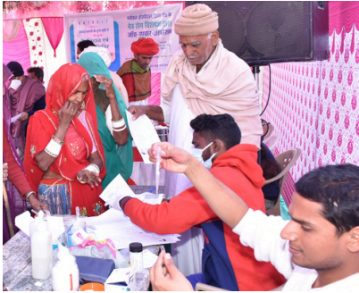
Free Healthcare Camps